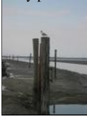
Seagull by lowtide