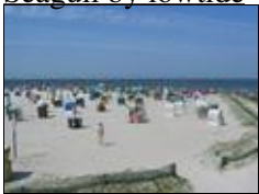
Beach at summer