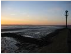
Harbourlight by sunset