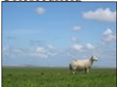
A sheep on the embankment