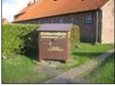
Tasty potatoes in a chest