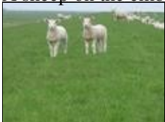
Many sheep on the embankment