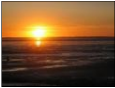
Sunset at the wadden sea