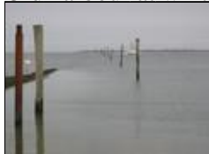
Ferry at high tide