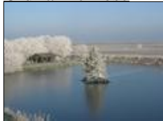
Old harbour at wintertime